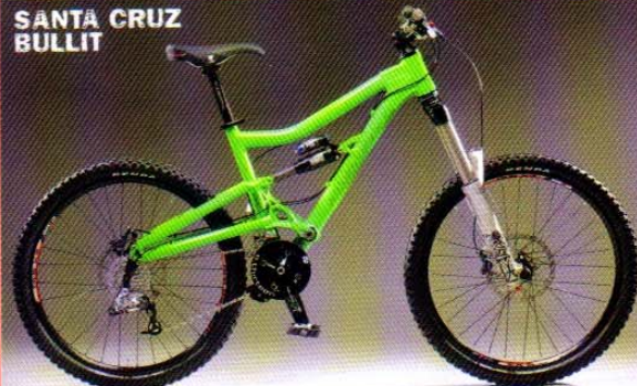
SANTA CRUZ BULLIT