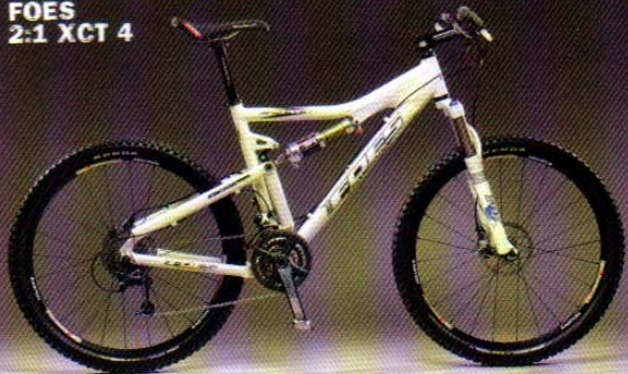
FOES 2:1 XCT 4